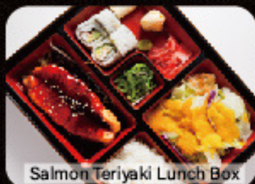
Salmon Teriyaki Lunch Box

Each Order is portioned for individual only.