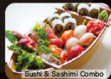
Sushi & Sashimi Combo