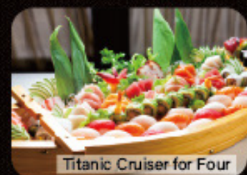
Titanic Cruiser for Four